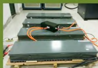
Charge & Discharge Test