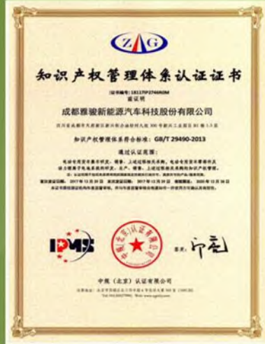
Certificate of Knowledge Product Management System Certification