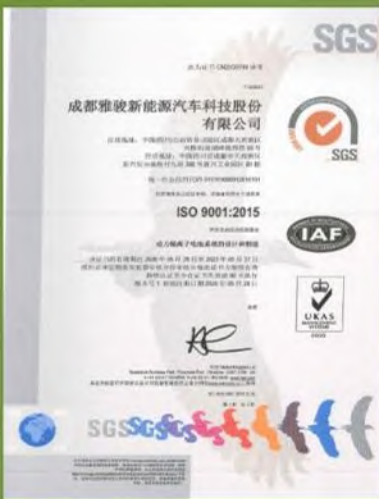
ISO 9001 Certification.