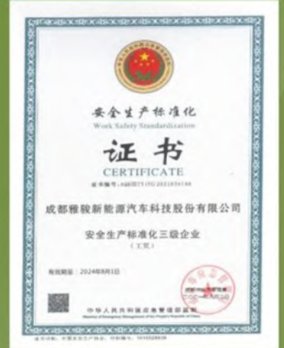
Certificate of Standardization of Safety Production Certification