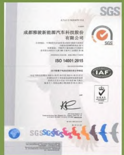
ISO 14001 Certification