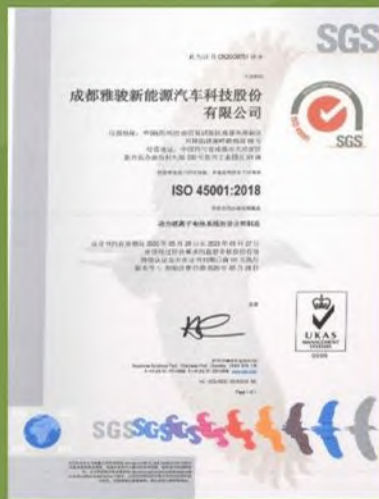
ISO 45001 Certification