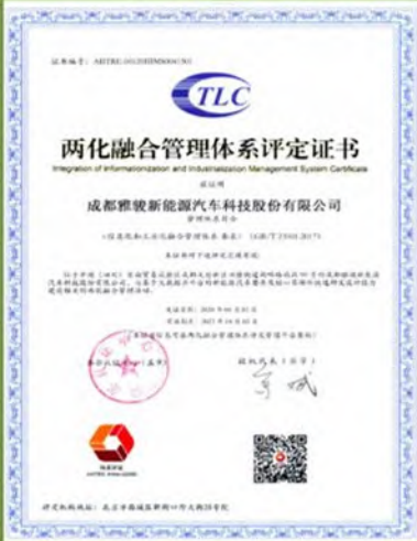
Certificate of Conformity of Integrated Management System for Informatization and Industrialization